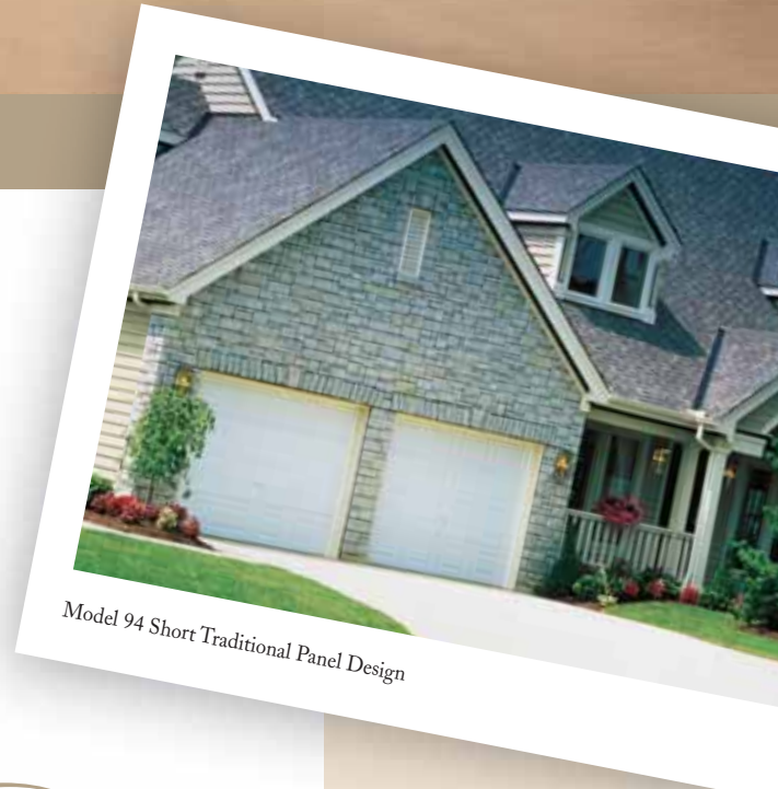
Model 94 Short Traditional Panel Design

With a 2" steel frame and 24-gauge steel construction, the Model 94 is designed for long-lasting performance. The Traditional Panel and four color options combine with Designer or Classic Collection window designs to give you a garage door that suits your home style and lifestyle.