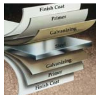
Unsurpassed Rustproofing System