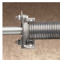
Galvanized Torsion Spring