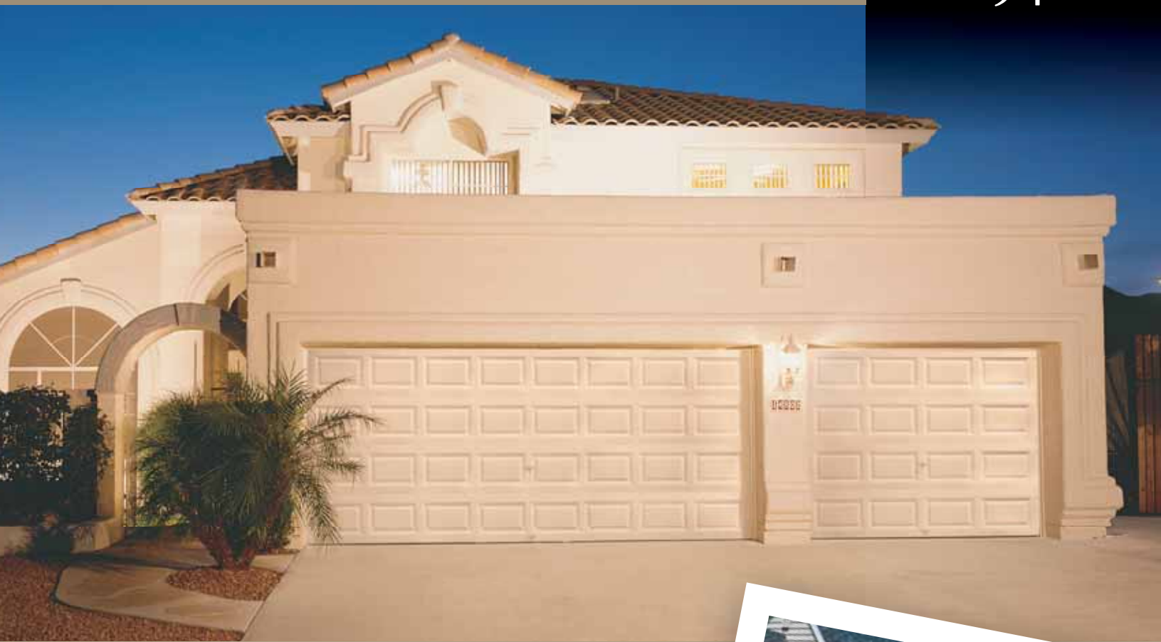
Model 94 Short Traditional Panel Design

With a 2" steel frame and 24-gauge steel construction, the Model 94 is designed for long-lasting performance. The Traditional Panel and four color options combine with Designer or Classic Collection window designs to give you a garage door that suits your home style and lifestyle.