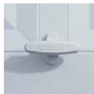
Step Plate/ Lift Handle