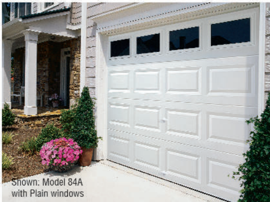
Shown: Model 84A with Plain windows