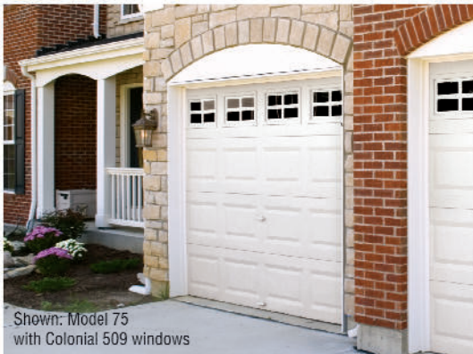
Shown: Model 75 with Colonial 509 windows