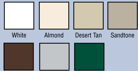
Brown Gray Hunter Green

(Printed colors may vary from actual panel colors.)