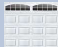
Long with Grille

See pages S19-S21 for all available window designs and options.