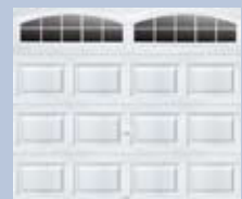
Long with Grille

See pages S19-S21 for all available window designs and options.