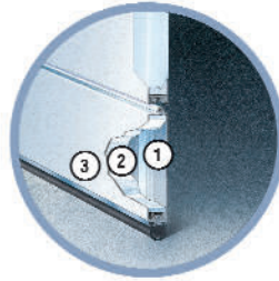
① Steel + ② Insulation + ③ Steel